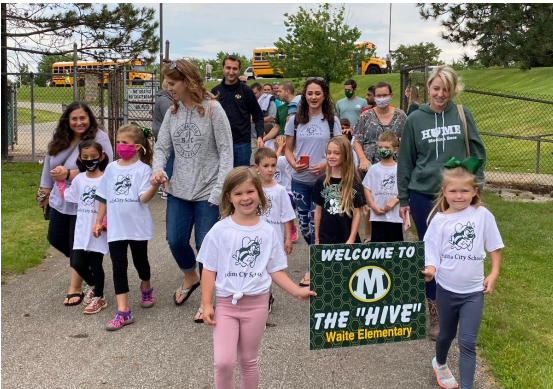
First Graders Enjoying STEM Days!